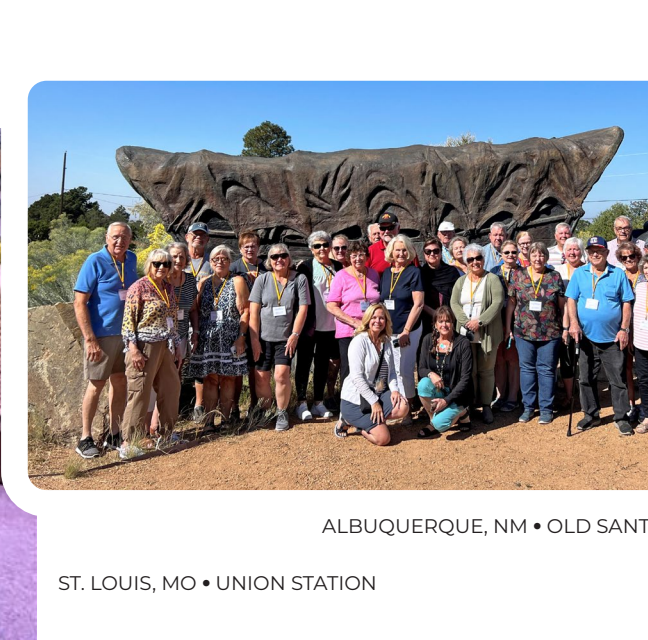
ALBUQUERQUE, NM • OLD SANTA FE TRAIL

Two bus trips capped off the Select 50 Club adventures for 2024. Picture-perfect weather accompanied our group as we made our way down to Albuquerque and Santa Fe. We enjoyed a week of gorgeous scenery, great food, and a few kicks on Route 66! Then we all enjoyed a merry time in St. Louis for a fun-filled holiday getaway. We hope you will join us in 2025 by registering for one of our memory-making adventures. Look inside for all the exciting details!